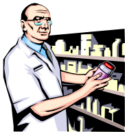
Health Science Technology Education